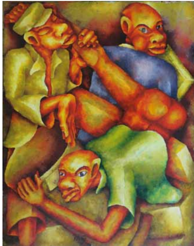
2. Street boy. Oils on canvas - 79x99 cm