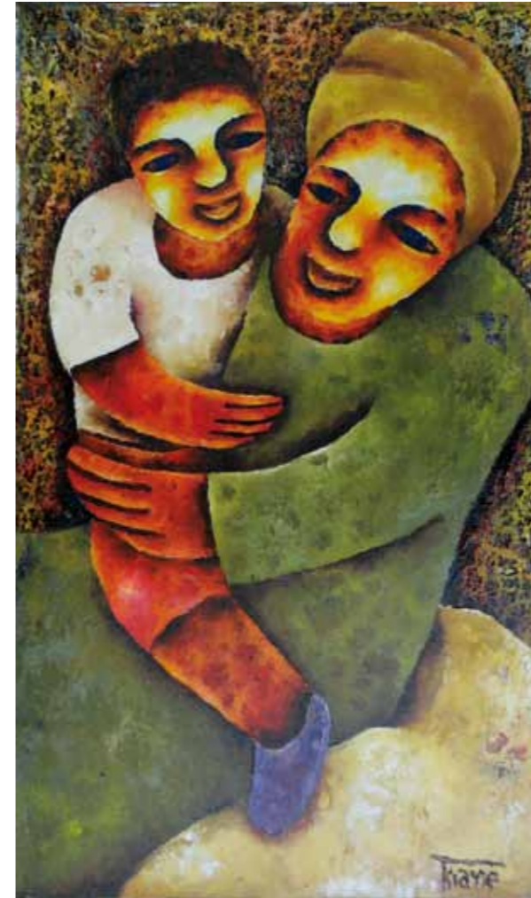
4. Mother and child. Oils on canvas - 39x66 cm