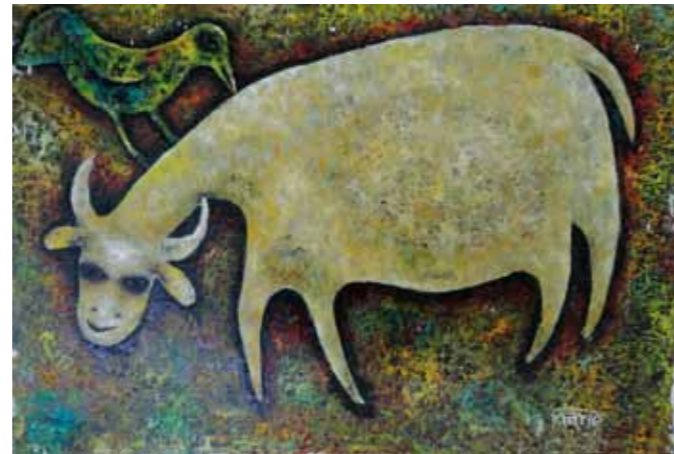
3. Friends. Oils on canvas - 76x51 cm