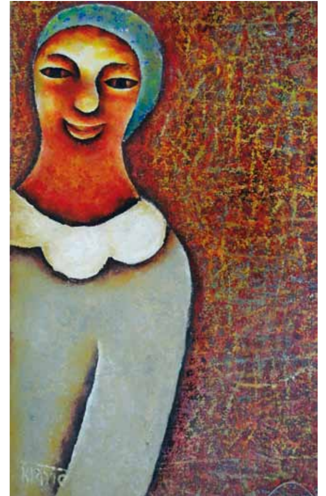
5. A peeping face. Oils on canvas - 39x62 cm