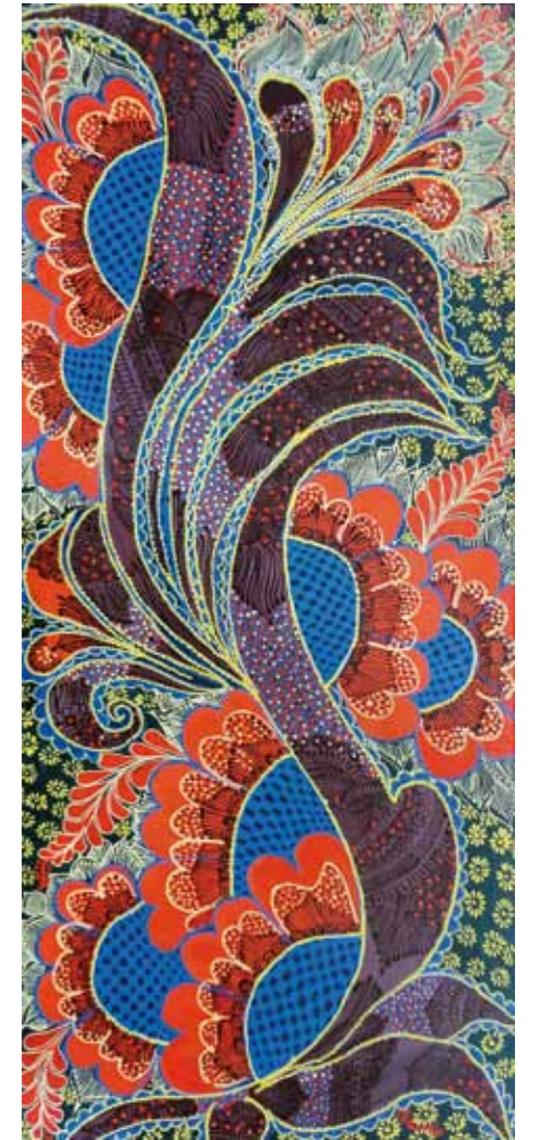
2. Untitled heena paintings. Acrylic on canvas - 40x60 cm