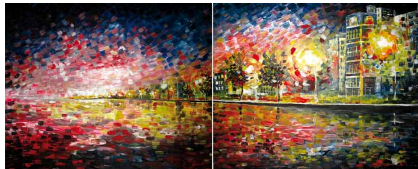
2. Fishermen's eye. Mixed media on canvas - 60x80 cm